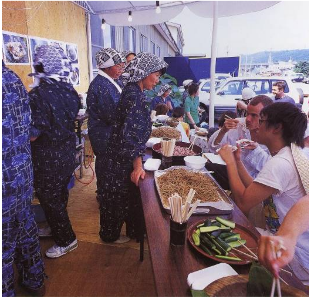
The Silk Plaza, Performance and Installation, The women's group cooking at the opening of the Festival The Echigo-Tsumari Triennial, Japan. 2000. Photography: Tony Bond. Photographer: Previously published in The Echigo-Tsumari Catalogue, 2000. Published by Art Front Gallery, Tokyo. P.99.