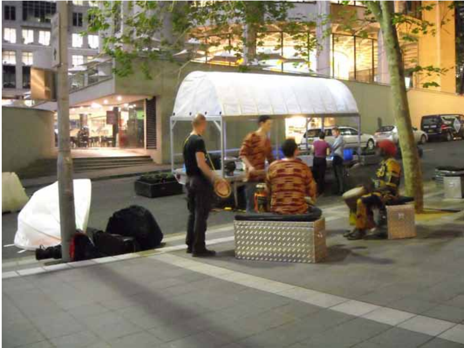
Street Music at the trailer