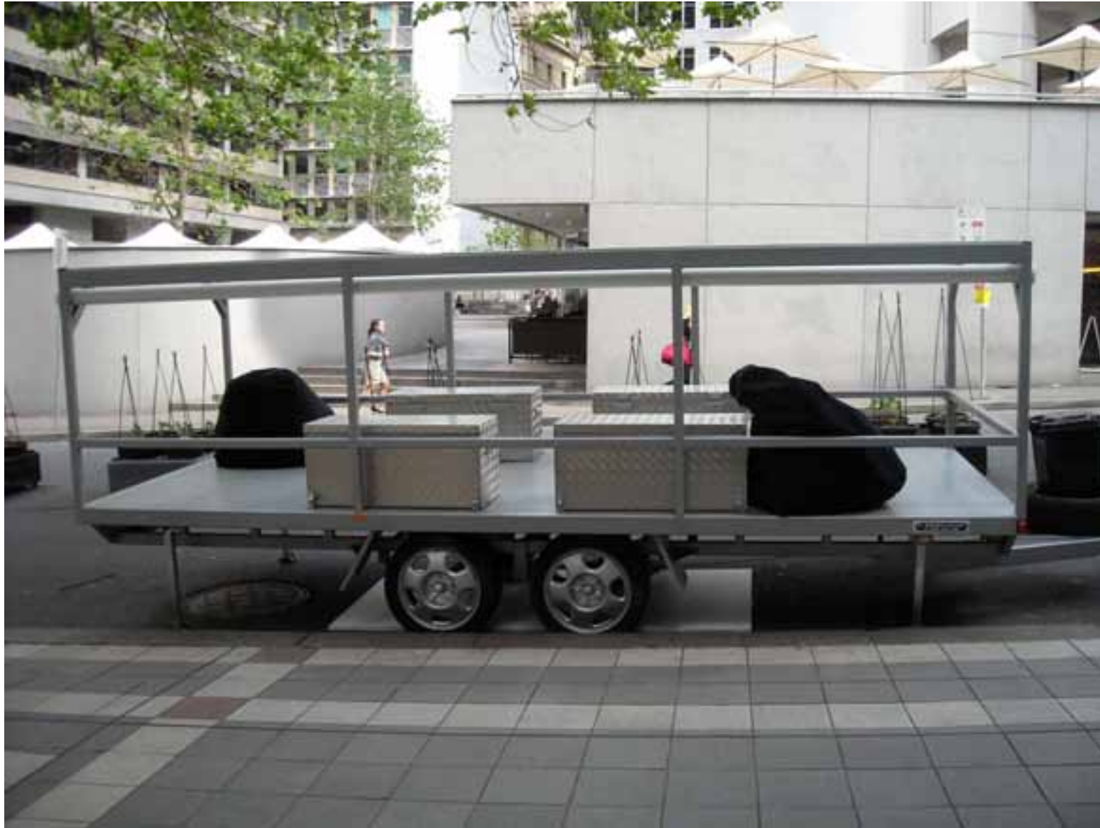
Completed prototype of the Sydney Chill Trailer, with the canopies packed away.