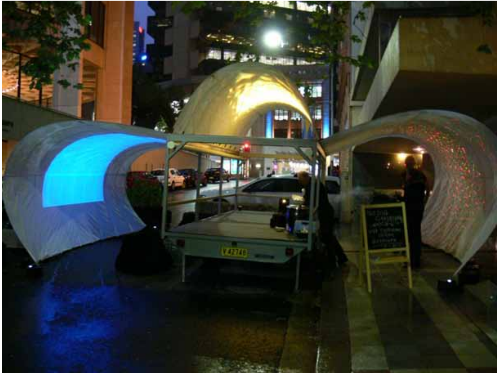
Sydney Chill Trailer at night