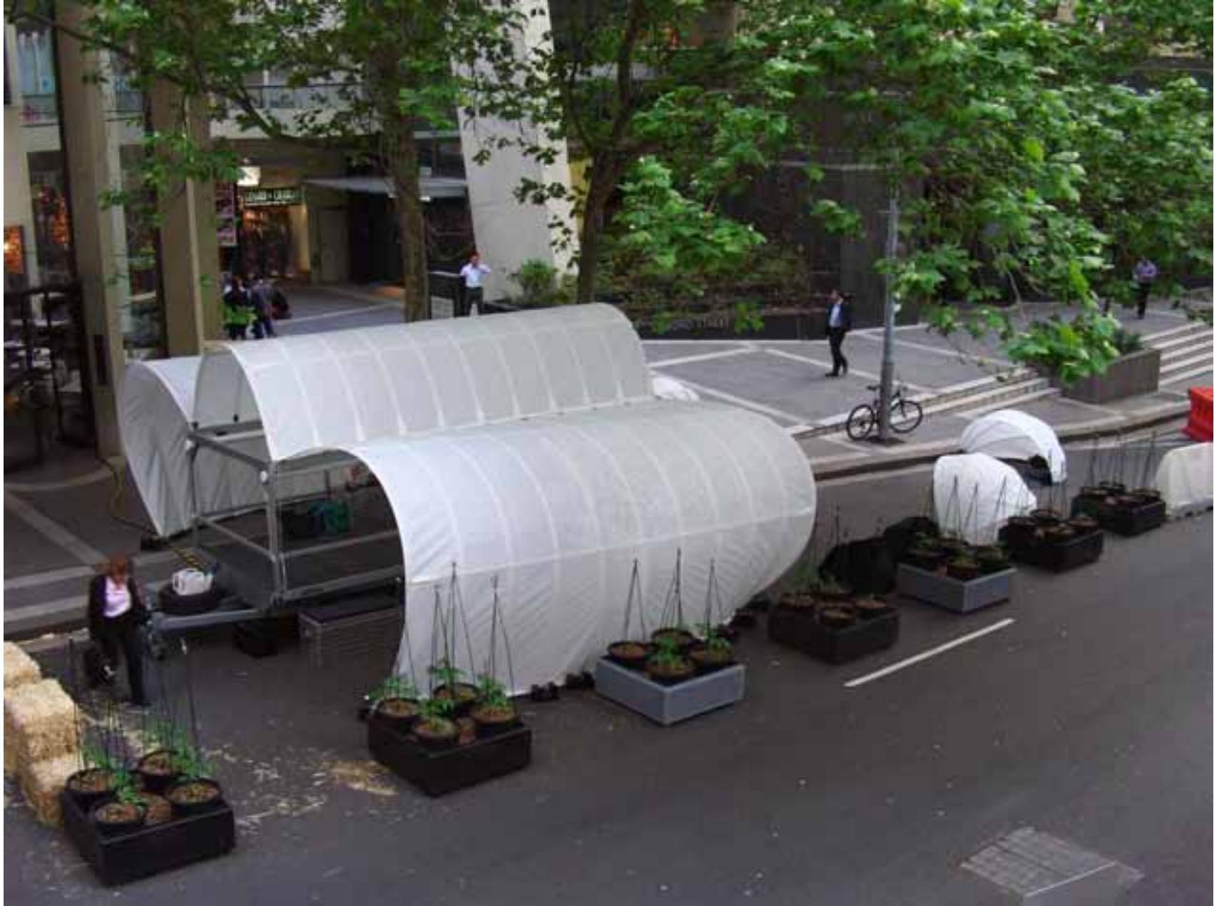
Sydney Chill Trailer with the canopies open