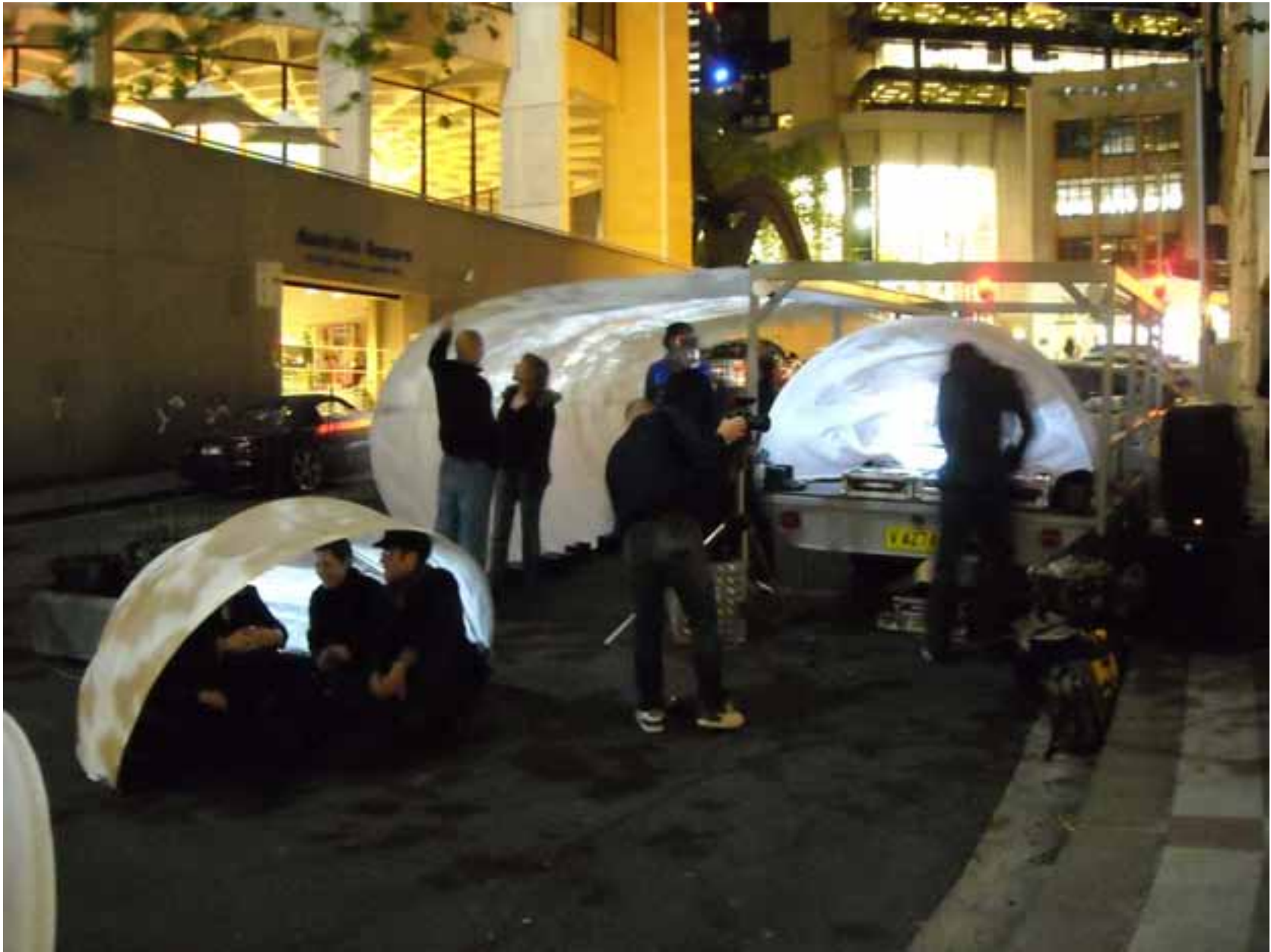
Night Time Action