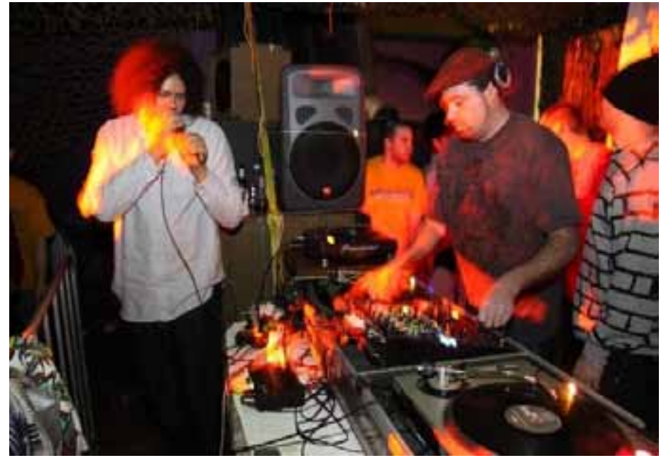
DJ Spin FX at the trailer, music happening.